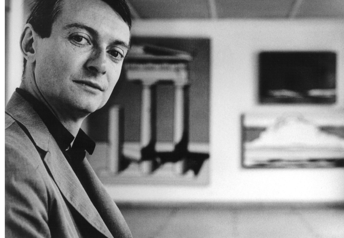
Roy Lichtenstein at his exhibition Roy Lichtenstein, Galerie Ileana Sonnabend, Paris, 1965. (detail)

The Roy Lichtenstein Award will be selected each year by FCA’s Board of Directors through the Grants to Artists program. Established in 1993, Grants to Artists provides significant, unrestricted assistance to individual artists in all disciplines; nominations are confidentially accepted from invited artists and arts professionals once a year, and the recipients are announced in January. The inaugural Roy Lichtenstein Award recipient will be announced in January 2018.