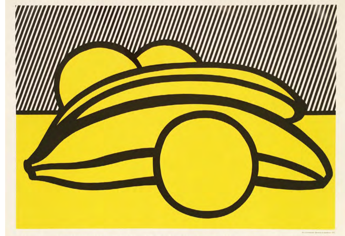
GREENBERG GALLERY · 44 MARYLAND PLAZA · ST. LOUIS, MO.