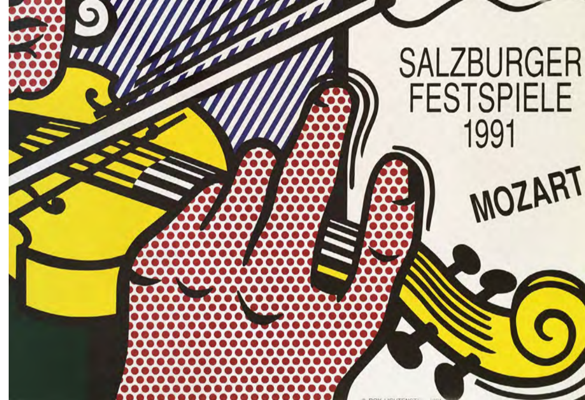
Roy Lichtenstein, “Salzburger Festspiele 1991 Poster,” 1991. Offset lithograph on 200-gram MGP paper, 25 1/2 x 34 inches. Unsigned. Framed. $1,800.